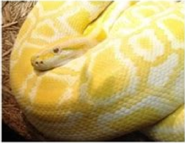
Albino Burmese Python