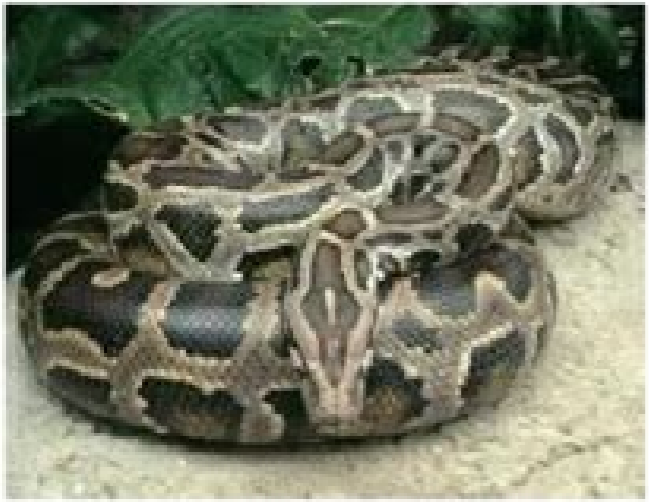
Normal colouring Burmese Python