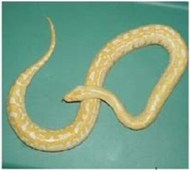
Ladder Albino Burmese Python